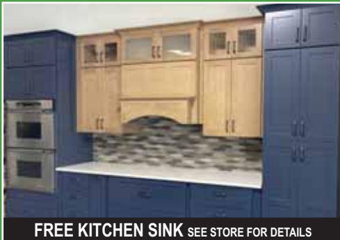
FREE KITCHEN SINK SEE STORE FOR DETAILS

WOOD CABINETRY • QUARTZ & GRANITE COUNTERTOPS • BATHROOM VANITIES • WATER PROOF FLOORING